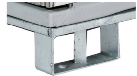
PALLET BASE (SUPPORTS)