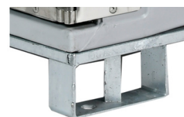
PALLET BASE (SUPPORTS)